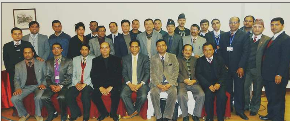
IECCD Family Including the Workshop Participants from other Divisions of Ministry of Finance

After putting the AMP website for public back in 21 June 2013, the IECCD of Ministry of Finance has been conducting series of consultation and review meetings to institutionalize the AMP as a useful tool for transparent and accountable aid mobilization system in Nepal. To share the international best practices in AMP operation, a team led by IECCD Chief participated in Aid Management Platform