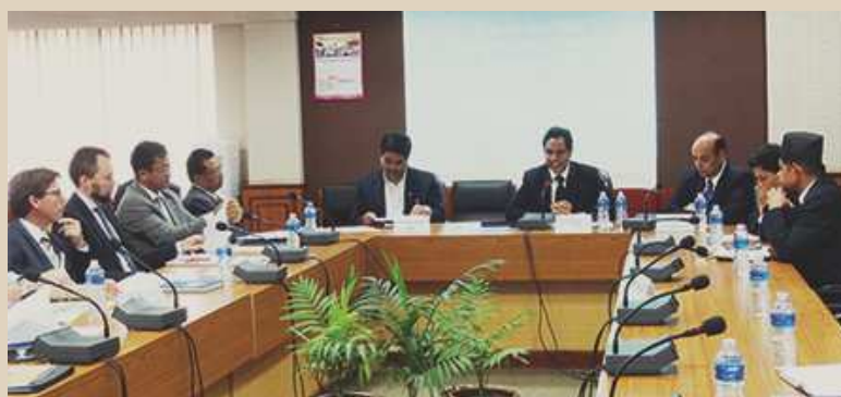
NPPR Third Review Meeting Floor

The Champions of 5 different thematic groups namely Public Financial Management, Public Procurement, Human Resource Management, Managing for Development Results (MFDR) & Mutual Accountability and 4 Sectors including Local Governance, Roads and Transport, Agriculture & Energy made presentation on the progresses achieved in their corresponding sectors