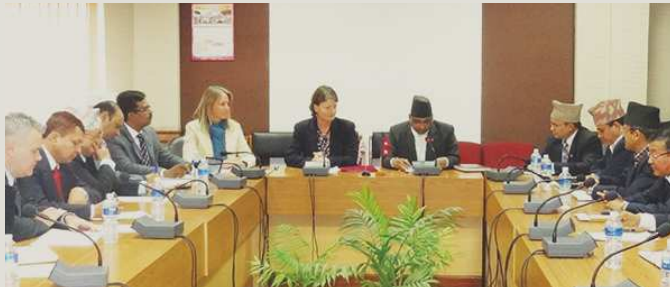
A Glimpse of Signing Ceremony between GoN and DFID

The Government of the United Kingdom of Great Britain and Northern Ireland has agreed to provide grant assistance of Pound Sterling 70 million