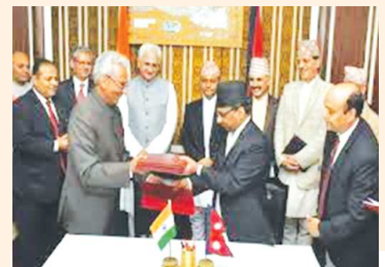
Finance Secretary Mr. Shanta Raj Subedi and Indian Ambassador to Nepal Mr. Jayant Prasad after signing the Agreement in the presence of Rt. Hon. Chairman of Interim Government, Hon. Finance Minister, Hon. Indian External Affairs Minister and other officials

The Government of India has agreed to provide 764 vehicles to Nepal for the purpose of the upcoming Constituent Assembly (CA) election. Two different agreements to provide the vehicles were signed at the Office of Prime Minister and Council of Ministers in the presence of Rt. Hon. Khil Raj Regmi, Chairman, Interim Government and Hon. Indian Minister of External Affairs Mr. Salman Khurshid on July 09, 2013.