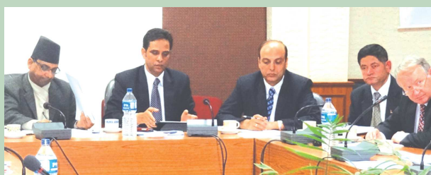
From left: Finance Secretary, IECCD Chief, Under Secretary IECCD and DP Officials

expressed their satisfaction over the progress achieved so far. DPs raised some queries about the overall effectiveness of the performance including decreasing capital expenditure and other contemporary issues and provided some important suggestions to GON for the effective implementation of their suggestions regarding overall portfolio management in Nepal.