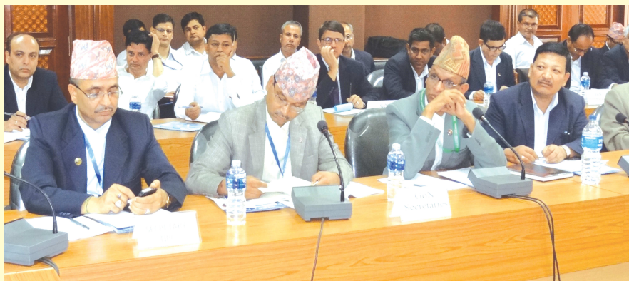
GoN Secretaries and Officials

for mutual accountability, where capacity of both the Government and donors can be evaluated.