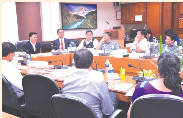
GEF stakeholders participating in discussion during the workshop on biodiversity

Two different workshops related to Global Environment Facility (GEF) activities in Nepal were organized by IECCD, Ministry of Finance, under GEF Operation Focal Point Support Program. The first workshop entitled “GEF Stakeholders’ Workshop on Biodiversity” was held on August 8, 20103 and the second entitled “GEF Workshop on Land Degradation and POPs and Chemical” was held on 26 August, 2013.