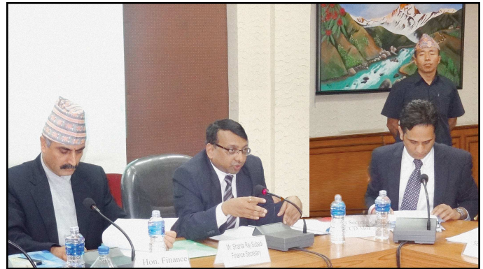
Hon. Finance Minister, Finance Secretary and IECCD Chief