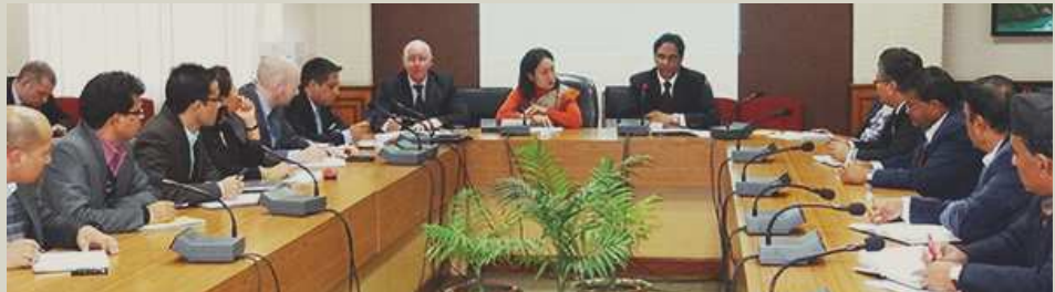
A Glimpse of CPAP review Meeting