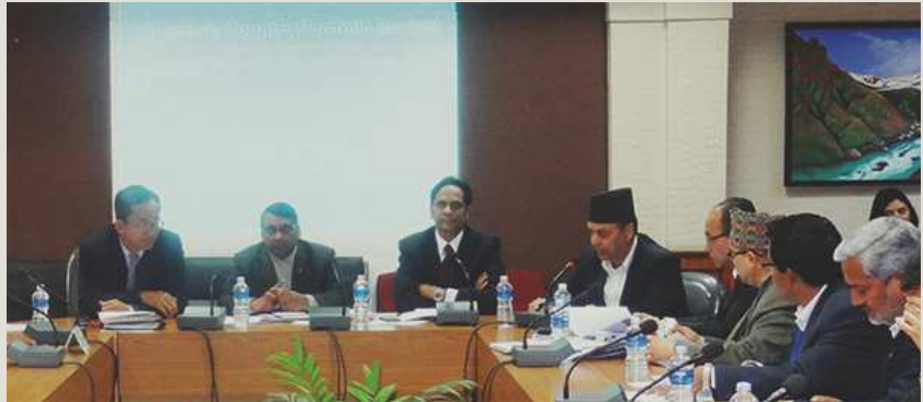
From Left: ADB Country Director, Finance Secretary, IECCD Chief, Joint Secretary IECCD and other Participants