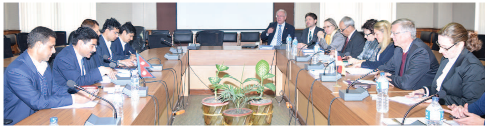
A Glimpse of Bilateral Meeting

Nepal - German Government Negotiations on Development Cooperation