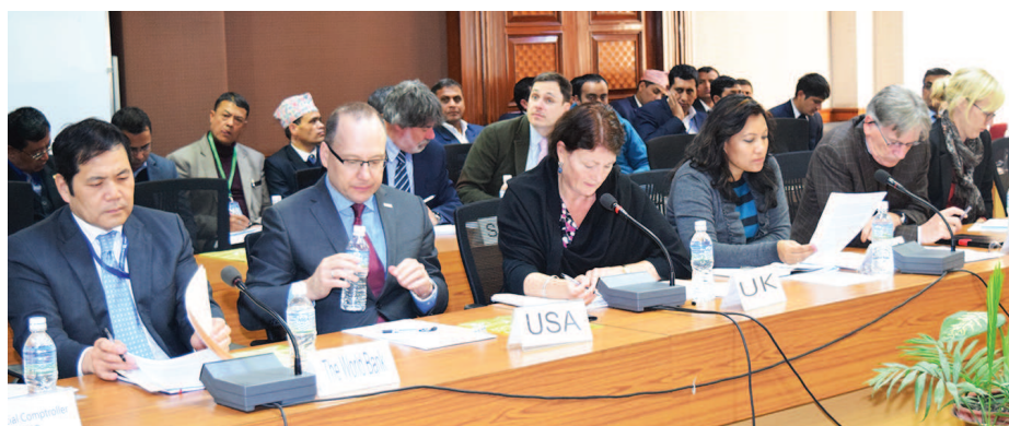
A Glimpse of Meeting

will move ahead as per fundamental aspects of market based economic system at least for 20 years and will build foundation for socialism oriented economy as envisioned in the New Constitution.