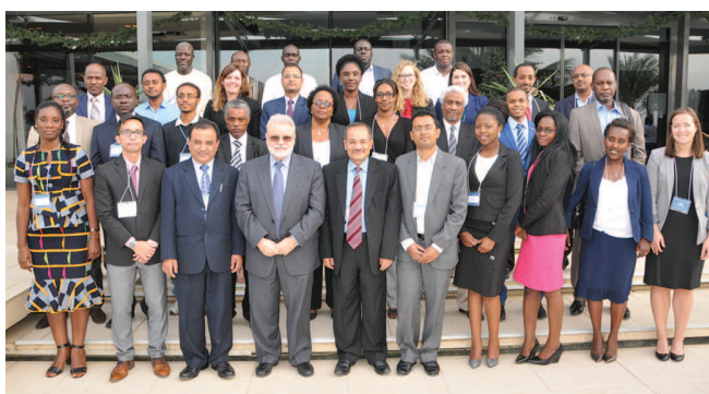
Workshop participants from different countries

of AMP across government ministries; incentivizing data use; and coordinating national and subnational planning processes. Country delegations also have had the opportunity to create an outreach plan and communications tool to bring back to their governments, helping communicate the value of AMP data for the 2030 Agenda. Nepal delegates made a presentation on how they managed to report data on the earthquake response and INGOs through the use of AMP. Similarly, they shared experience on how AMP data were used for Global Partnership Survey conducted in 2015 including publication of various reports based on AMP data. Nepal also represented in the Panel Discussion together with the representatives from Senegal, Cote d'Ivoire and Ethiopia on how to accelerate using of AMP data across the Governments. Workshop attendees included 30 government officials from 9 countries – Nepal, Senegal, Cote d'Ivoire, the Gambia, Chad, Malawi, Ethiopia, the Philippines, and Haiti.