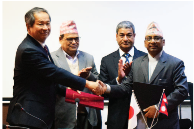
From Right: Finance Secretary Mr. Subedi, Hon. Minister of Physical Infrastructure and Transport Mr. Lekhak, Hon. Finance Minister Mr. Mahara and H.E. Ogawa, Ambassador of Japan

The project aims to improve the alignment of the existing road, reduce the travel time and enhance traffic safety in Nagdhunga Naubise area. The objective of the project is to improve the road condition around Nagdhunga pass by constructing a tunnel, thereby contributing to the smooth transportation network between Kathmandu valley and other major areas of Nepal. The major activities of the project are: a) Construction of 2.35 km tunnel with 2 motorable lanes and 1 extra lane. b) Construction of 2.25 km approach road. c) Establishment of the power supply facilities. Ministry of Physical Infrastructure and Transport will be the executing agency and the Department of Road will be responsible for the implementation of the project. The cost of this project is about 21 billion Japanese