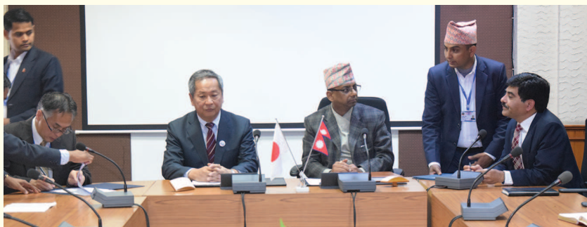
A Glimpse of Grant Agreement

Government of Japan, Japan International Cooperation Agency (JICA), has agreed to provide 754 million Japanese Yen (approx. NRs.692 million) grant assistance for the Project for Improvement of Medical Equipment in Tribhuvan University Teaching Hospital (TUTH); and a grant assistance of 350 million Japanese Yen (approx. NRs. 321 million) to the Government of Nepal under the Grant Assistance scheme in Japan's Fiscal Year 2016.