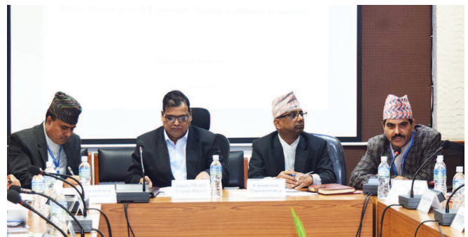
From Right: Joint Secretary IECCD, Finance Secretary, Hon. Finance Minister and Secretary (Revenue)