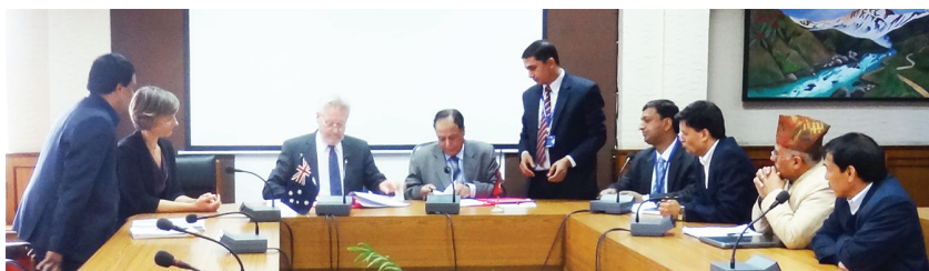
A Glimpse of Signing Ceremony

as stipulated in the Development Cooperation Policy. Government of Australia has been supporting SSRP as one of the prominent pool partners. The extended Joint Financing Arrangement (JFA) has already been signed among pooling partners including Australia as a guiding framework for implementing the SSRP.