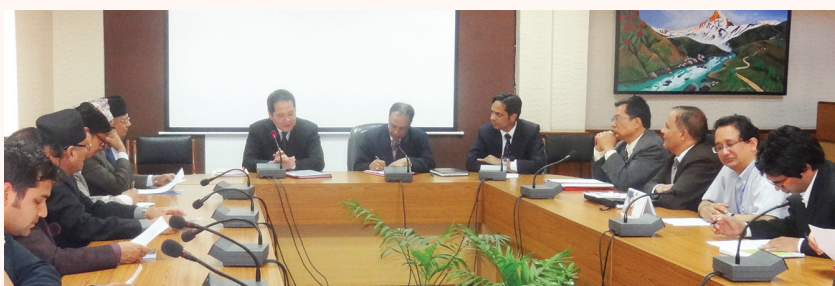
A glimpse of Signing Ceremony