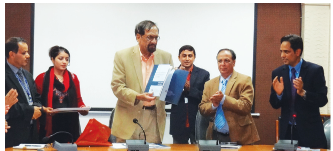
Hon. Finance Minister Unveiling DCR, 2013-14

The DCR revealed 71 percent of aid disbursed on-budget