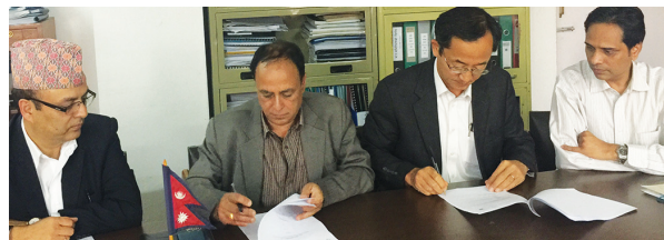
A Glimpse of ADB Pledge Amount Signing Ceremony

Asian Development Bank (ADB) has agreed to provide a cash assistance of US$ 3 million (about Rs. 30 Crores) to support immediate relief efforts in the wake of the powerful earthquake of 7.8 magnitudes which struck the country on 25th April, 2015.