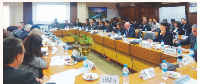
A Glimpse of Meeting

Ministry of Finance organized regular Local DPs Meeting on 18 March 2015 at the Ministry in the aftermath of mid-term review of the budget implementation. The meeting was chaired by Honorable Finance Minister Dr. Ram Sharan Mahat. Hon. Dr. Swarnim Wagle and Hon. Dr. Chandra Mani Adhikari, Members of National Planning Contd P7