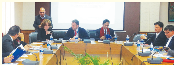
A Glimpse of CPAP Review Meeting