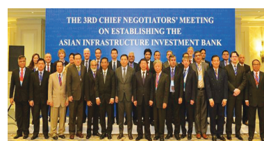
CNM of AIIB Participant

Agreement (AOA), operational policies, recruitment and AIIB facilities. The meeting was focused on discussion