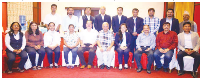
Glimpse of Negotiation Skill Training Participants

and Ministry of Education shared their experience and knowledge during the sessions. Manners, etiquette and skills for negotiators and types of negotiation among others were shared and discussed in various sessions. Simulated negotiation exercise supported by video recording and display was also conducted