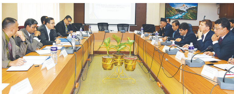
A Glimpse of Meeting (Rt. Side Nepali Delegates and Lt. Side Indian Delegates)