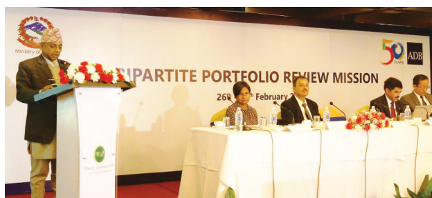
Finance Secretary Addressing the Meeting