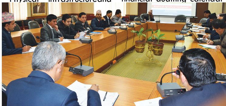
A Glimpse of Meeting