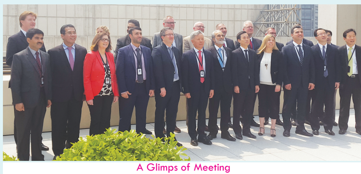
A Glimps of Meeting

During the meeting, the policy issue on Credit Rating, New Membership, Board Committees, Prohibited Practice and International Advisory Panel were also discussed.