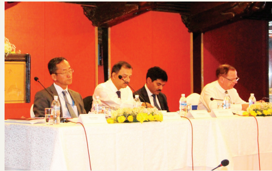
A Glimpse of Meeting

Nepal Tripartite Portfolio Review Meeting (TPRM) was held on 21 April 2016 in Kathmandu. The Participants of this meeting were Asian Development Bank's (ADB) management teams and staffs, government's line ministries and project executing/implementing agencies. In this meeting, there was discussion on the major issues of selected individual projects and the sector. The main issues of the projects were raised as prolonged procurement process, weak project management capacity of EAs/IAs, weak performance of consultants and contractors, high turnover of account staffs in key infrastructure projects. The meeting decided on the actions to address those issues for improving the portfolio performance more specifically meeting the contract award and disbursement targets agreed by the executing and implementing agencies. As of 31 March 2016 ADB portfolio comprised of 23 loans and 21 investment grants totaling $1.7 billion. The total contracted amount is $808.8 million (47%) and disbursement is $481.8 million (28%). The 2016 contract award and disbursement targets are $414.3 million and