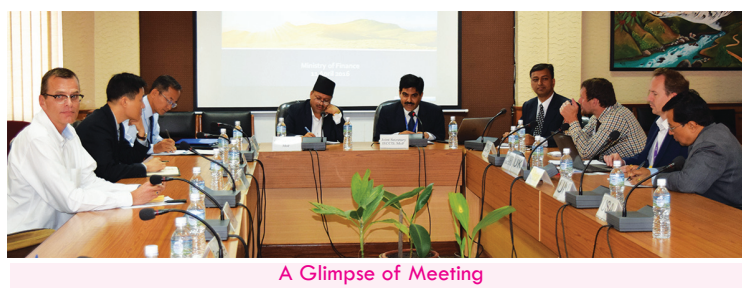
A Glimpse of Meeting