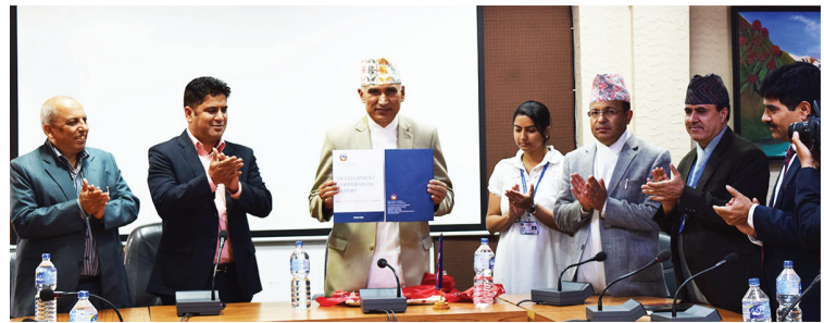
Hon. Finance Minister Mr. Paudel Unveiling DCR, FY 2014/15