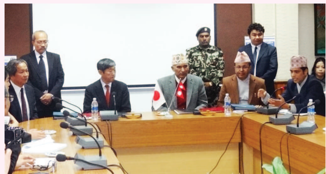
A Glimpse of Signing Ceremony

The Government of Japan has agreed to provide an assistance of NRs 26.19 billion (Japanese Contd P5