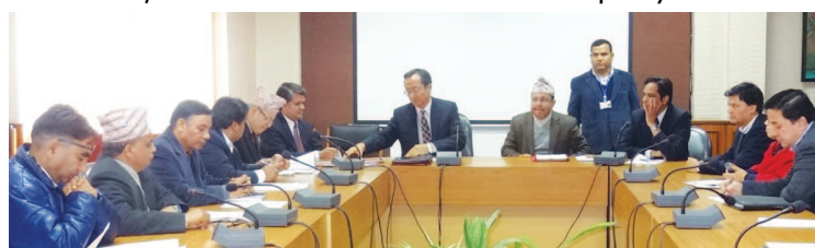
A Glimpse of Signing Ceremony

The Asian Development Bank (ADB) has agreed to provide an additional financing of US$ 90 million (approximately NRs 9.54 billion) to the Government of Nepal for the implementation of Kathmandu Valley Water Supply Improvement Project (KVWSIP). The Agreement to this effect was signed between Government of Nepal and the Asian Development Bank, at the Ministry of Finance, Kathmandu, on 07 December 2015.