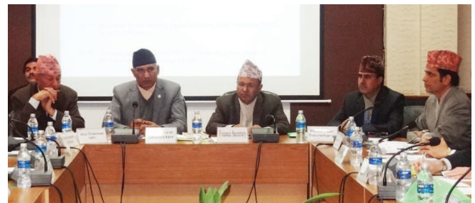
From right: Vice Chairman NPC, Finance Minister, Finance Secretary, Revenue Secretary, IECCD Joint Secretary