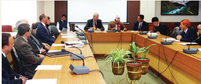
A Glimpse of Signing Ceremony

heritage sites including surrounding school buildings in Bhaktapur district, reconstruction of district hospitals in Gorkha, Rasuwa, Dolakha and Ramechhap districts and rehabilitation of rural electrification in Rasuwa districts which were damaged by the earthquake.