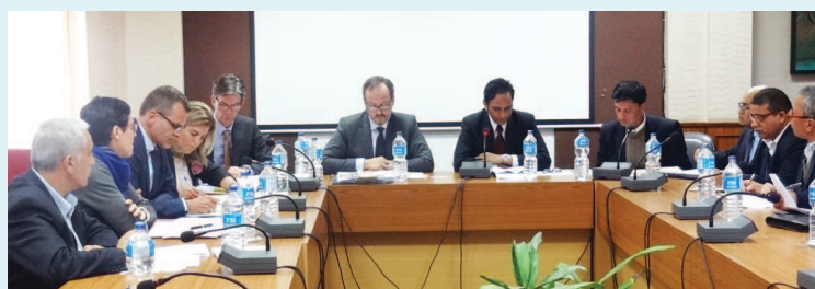
A Glimpse of Meeting

In addition, he appreciated the prompt response of the EU to the Government of Nepal in the aftermath of the devastating earthquake on last April. In this regard, proposed assistance of Euro 105 million for Nepal EU Action for Recovery and Reconstruction (NEARR) programme as pledged during the ICNR in June 2015 is a significant assistance for the post disaster response and recovery. He also mentioned the progress from government side to have an agreement for the implementation of NEARR in near future.