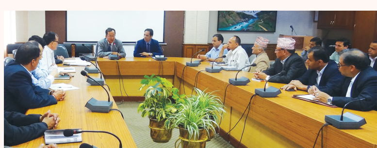
A Glimpse of Signing Ceremony

The main objective of this project is to restore critical public and social infrastructure and services with strengthened resiliency. The project consists of 4 components.