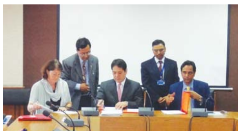
A Glimpse of Signing Ceremony

The World Bank, acting as an administrator of the Global Road Safety Phase 2 Multi-Donor Trust Fund, has agreed to provide US$ 7.47 million (equivalent to Rs 76 Crores 38 Lakhs) grant assistance to the Government of Nepal for the implementation of Road Safety Support Project. An agreement to this effect was signed on 9 June 2015 at the Ministry of Finance.