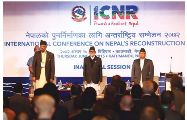
From Left: Hon. Finance Minister, Rt. Hon. Prime Minister and Hon. Foreign Affairs Minister at Opening program

In his inaugural speech, Rt. Hon. Prime Minister thanked all the governments and organizations for joining the conference and expressed homage for lives lost, including the US helicopter crash in Sindhupalchowk. In his speech, Rt. Hon. Prime Minister mentioned that though Nepal did