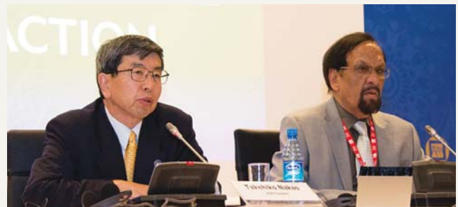
From Left: ADB President Mr. Nakao and Finance Minister Dr. Mahat

A nepali delegation led by Hon. Finance Minister Dr. Ram Sharan Mahat participated in the 48 th Annual Contd P7