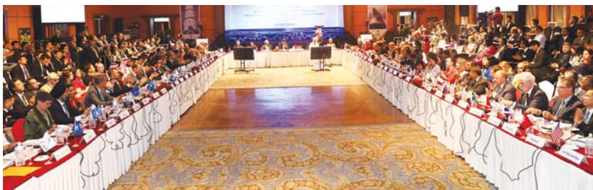
A Glimpse of ICNR Business Session

Business session chaired by Hon. Finance Minister Dr. Mahat started with a presentation by Hon. Vice Chairman of National Planning Commission Contd P5